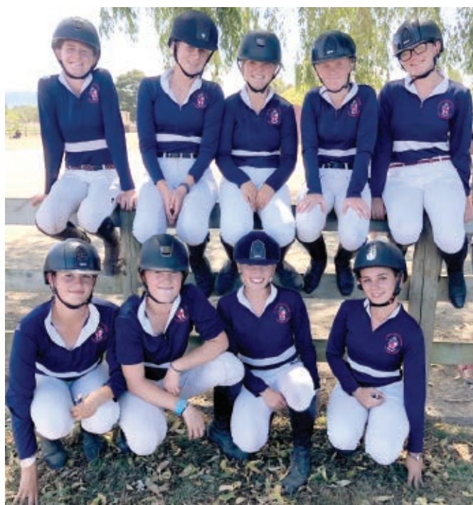
Our St Matthew's Interschool team.

Sadly, we also had to cancel our annual exchange with New